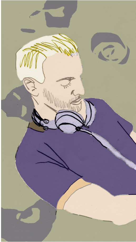
Handsome clown liquor and 420 friendly music entrepreneur.