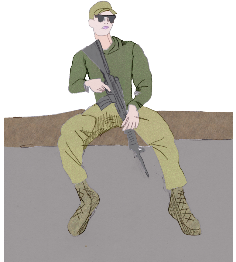
Man in uniform hopefully you're not a psychopath I'm chill as fuck.